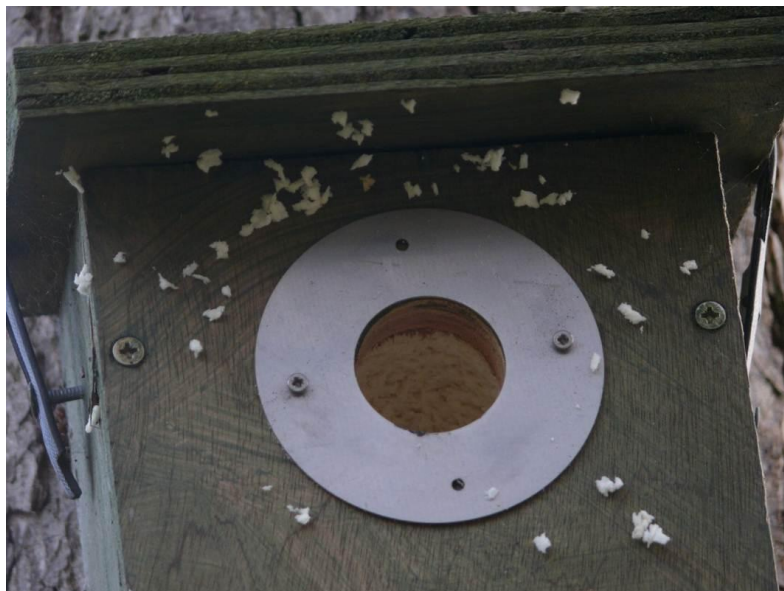
Plate 3. Example of a nest box that has been excavated

*The total adds up to more than 52 boxes because level of excavation changes with time.