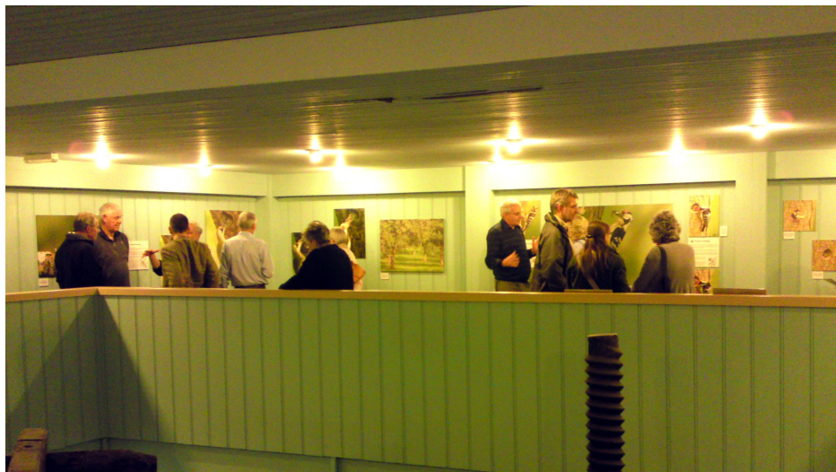
Plate 1. Exhibition at Hereford Cider Museum

exhibition moved from Westons to the old Tourist Information Centre at Queenswood Country Park (owned and managed by Herefordshire Council) and discussions are currently in place to exhibit the pictures at Hereford Cathedral.