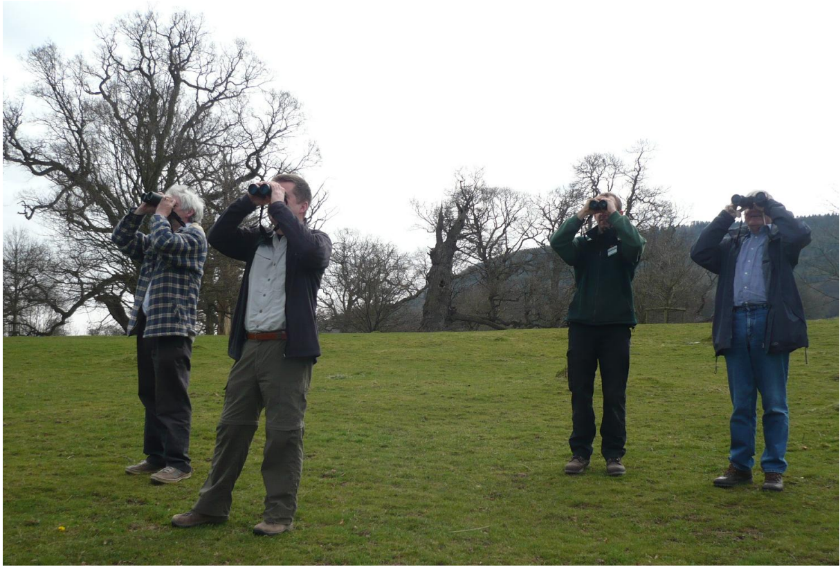
Looking for woodpeckers at Moccas Park National Nature Reserve