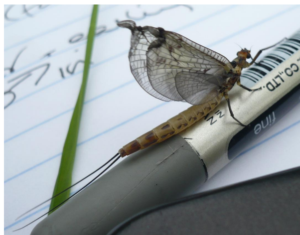
Plate 5. Ephemera danica . An important source of food for the lesser spotted woodpecker.

Also, Duncan Sivell from Buglife has identified invertebrate prey items on the images taken by Evan Bowen-Jones in 2010. Prey items included Ephemera danica , Alder sawfly, Nuctenea umbricata (spider), woolly aphids, slugs, and several species of lepidoptera larvae (possibly including northern winter moth). Whilst observing adult lesser spotted woodpeckers on the banks of the river Lugg in May 2011, taking food to the nest, Ephemera danica appeared to be a food preference. This invertebrate species is indicative of clean flowing rivers and lakes with sandy or gravel bottoms. This would further suggest that lesser spotted woodpeckers are an indicator species of a healthy environment.