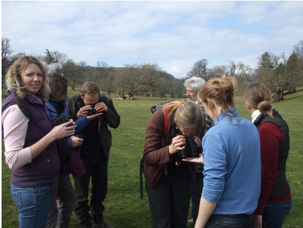
Plate 2. Inspecting green woodpecker droppings at Moccas Park NNR

We did spend a small amount of time looking at the green woodpecker droppings that were conveniently situated next to the pond (Plate 2).